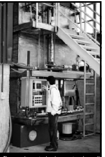
The membrane technology system is smal and easily expandable

Quil Ceda Village has placed the first ever order to build a membrane technology filtration facility in the United States, and we hope to have it up and running by fall of 2002. While the first stage of the plant will be to serve Quil Ceda Village, the plant will be expandable in the future to filter additional