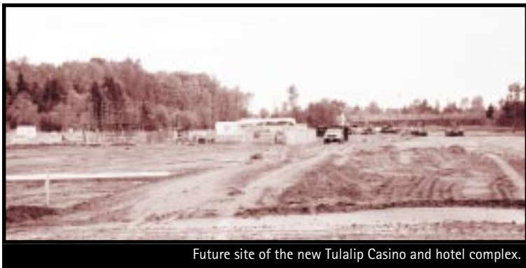
Future site of the new Tulalip Casino and hotel complex.

“Quil Ceda is not just the next step in tribal self-determination, but also the next step in community development for the reservation, Marysville, and the region,” said McCoy. “We are proud of the legacy we are building here.”