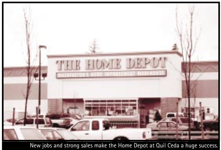
New jobs and strong sales make the Home Depot at Quil Ceda a huge success.

To the thousands of shoppers drawn to North Snohomish County's newest retail destination, Quil Ceda Village resembles another bustling, growing commercial center. But to the Tulalip Tribes, who own and operate the site, Quil Ceda is much more. For more than 3,000 tribal members living on the reservation east of Marysville, the development is the gateway to an economically diverse, prosperous future.