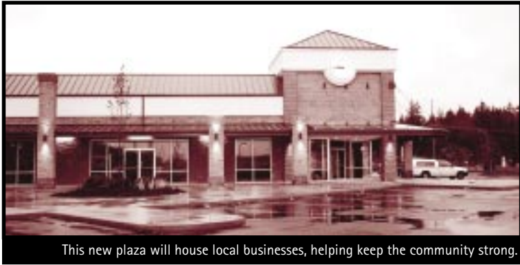
This new plaza will house local businesses, helping keep the community strong.

“We simply couldn’t gamble the future of our tribe on the success of our casino.”