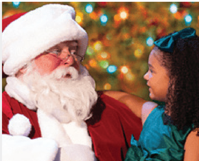
Santa's Wonderland at Cabela's

For more information, visit Cabelas.com/Santa .